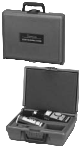
Model No. 45028