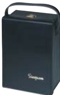
Model No. 00805